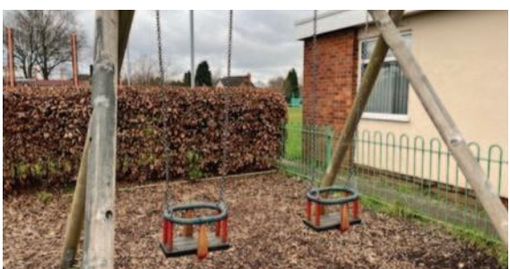
A broken swing on Shenstone Playing Field repaired.