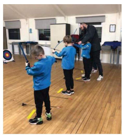
Beavers Archery at the Community Centre