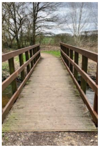
The wooden foot bridge re painted over the stream at Lammas Land

The wooden bench on the Lammas Land was sanded down where someone had put a throw away barbecue on the bench seat and it had burnt the bench seat – all sanded and repainted. Planters at the Cenotaph also repainted.