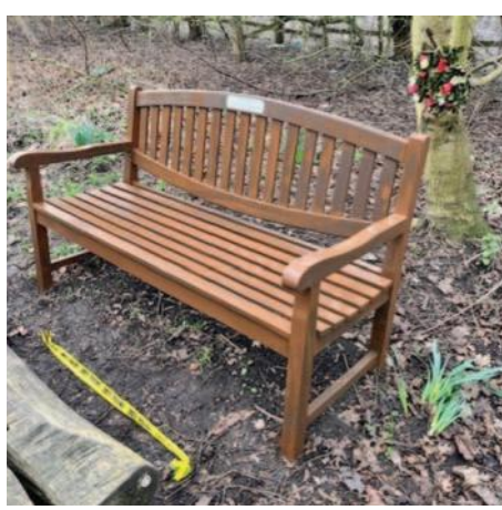
The wooden bench repainted on the Lammas Land.

The wooden bench on the Lammas Land was sanded down where someone had put a throw away barbecue on the bench seat and it had burnt the bench seat – all sanded and repainted. Planters at the Cenotaph also repainted.