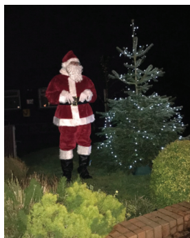
Santa pops in to Stonnall too